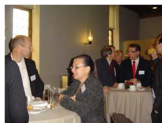
In between the sessions