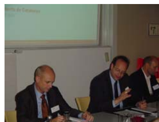
Seminar 2008 Panel Session